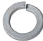
Single Coil Spring washer - BS4464 B