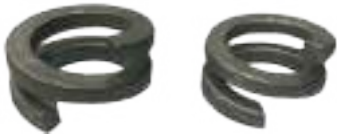
Double Coil Washer - IS 6755:2001