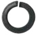
Wave Spring Washer - DIN 128