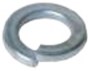
Flat Section Spring washers - DIN127B