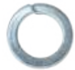
Spring Lock Washer - IS3063